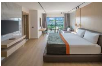
Executive Private Pool Suite 2 Bedrooms 175 m 2

In the area where the Deluxe Swim Up rooms are located, there is a separate 160 m 2 shared pool in addition to the main pool. On the shared pool terrace, each room has two sun loungers, one umbrella, two chairs, and one table.