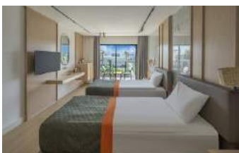
Executive Private Pool Suite 3 Bedrooms 190 m 2

Adjustable central air conditioning, minibar, tea and coffee set, telephone in the room and bathroom, luggage space, wireless internet, makeup mirror, USB charging unit, digital safe, hair dryer, premium bathroom amenities, bathrobe, and slippers.