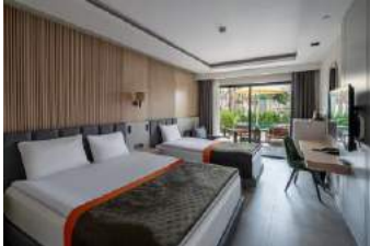
Deluxe Swim Up Room 37 m 2