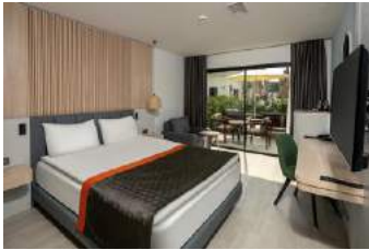
Deluxe Swim Up Family Room 63 m 2

In the area where the Deluxe Swim Up rooms are located, there is a separate 160 m 2 shared pool in addition to the main pool. On the shared pool terrace, each room has two sun loungers, one umbrella, two chairs, and one table.